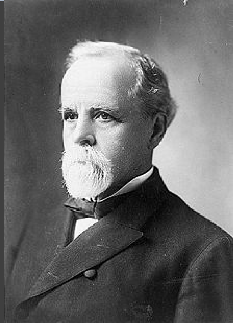
Congressman John F. Lacey